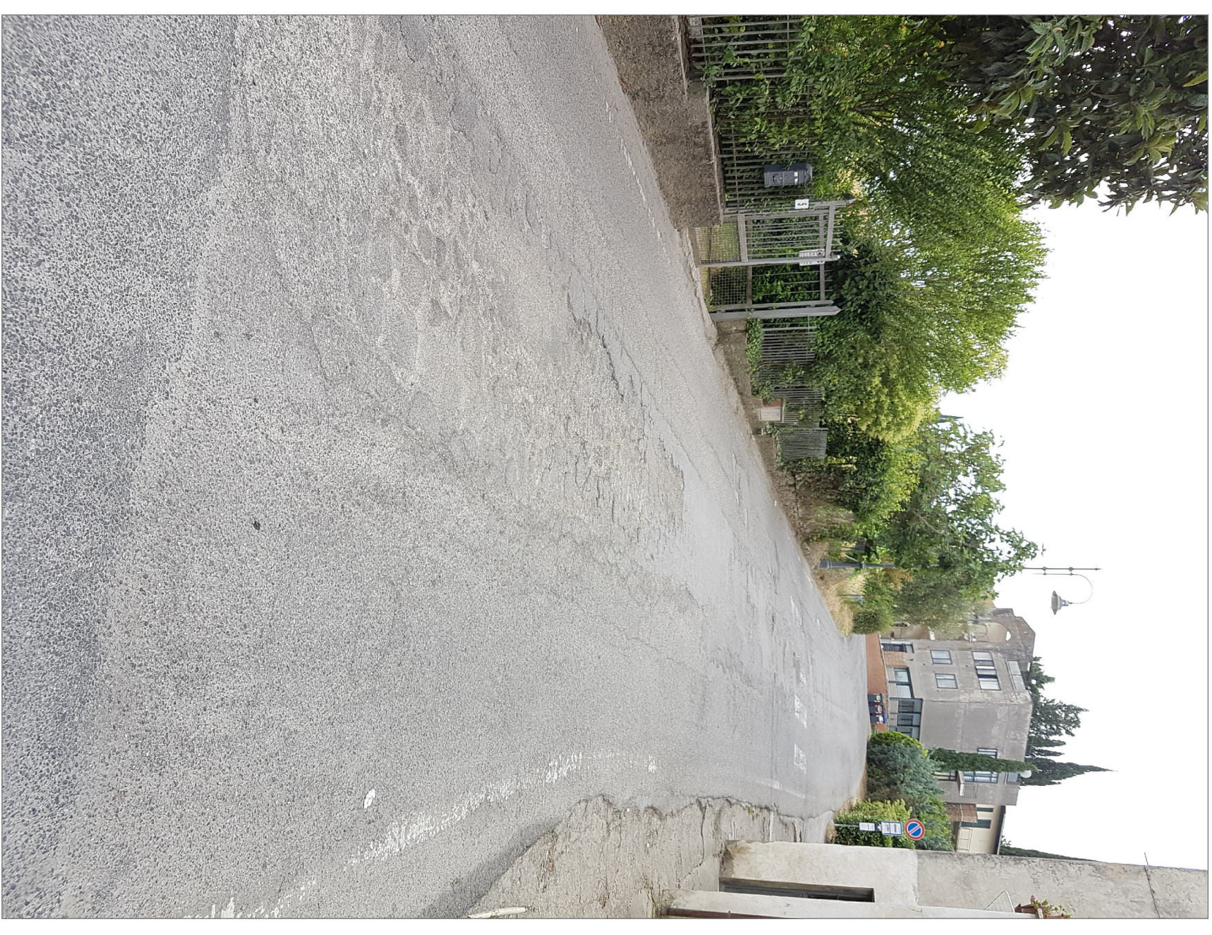
VIA DEL CASTRUCCIO